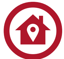
Indoor location compatible