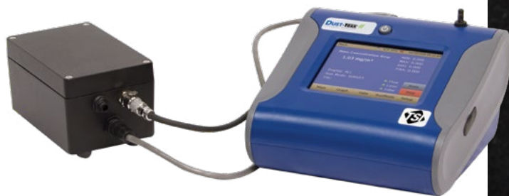
Desktop Monitor with External Pump, Model 8530EP

TrakPro™ Data Analysis Software allows you to set up and program directly from a PC. It even features the ability for remote programming and data acquisition from your PC via wireless communication options or over an Ethernet network. As always, you can print graphs, raw data tables, and statistical and comprehensive reports for recordkeeping purposes.