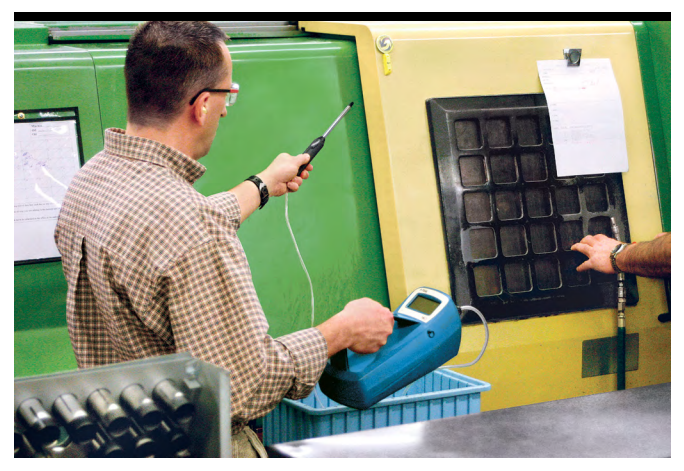
P-Trak Ultrafine Particle Counter and accessories includes: Telescoping Sample Probe, Shoulder Strap, Inlet Screen, Spare Wicks (2), Alkaline Batteries, Alcohol Fill Capsule with Storage Cap, Reagent Grade Isopropyl Alcohol, Zero Filters (2), Carrying Case, TrakPro®-Software, Computer Cable, Operation and Service Manual, Calibration Certificate, and Two-year Warranty.

PC with Microsoft Windows® 2000 or XP; Windows-compatible printer; 5 MB hard disk space; and available RS232 serial port (for downloading)