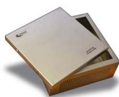
Cover for transmitter NS III LCD - Stainless steel 316